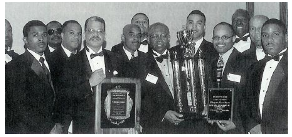
Wilmington Alumni – 2000

On-going activities of the Wilmington Alumni Chapter include the Ferris School For Boys, Adopt-a-Family, Kappa League East, Kappa League West, Kappa Klassic, The Achievers, Student of the Year, Halloween Party, Spelling Bee, Picnic, Spiritual, Christmas Formal, Founders Day, Senior Kappas, Chapter Outing, Achievement, Nominations, Reclamation, Audit, Nu Xi Chapter, Fall/Spring Event, Charity Bowling Tournament, Annual Golf Tournament, Cancer Walk for Life, and The Achievement Center.