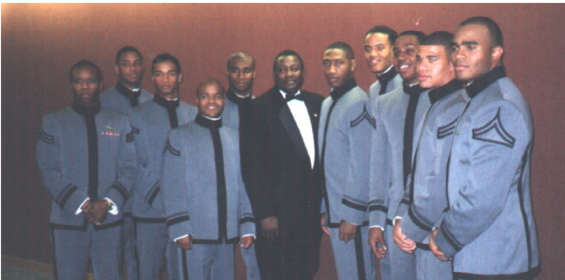
Kappa Mu brothers from West Point Military Academy attending Poughkeepsie Alumni 1999 Fall Dance