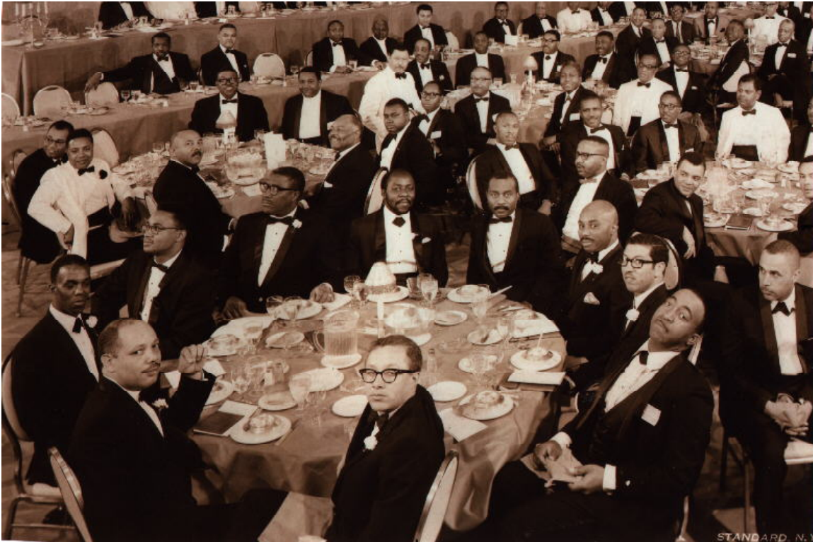
Chapter Chartered brothers at Kappa Alpha Psi Province meeting at the New York Hilton May 3-5, 1968 (foreground table)