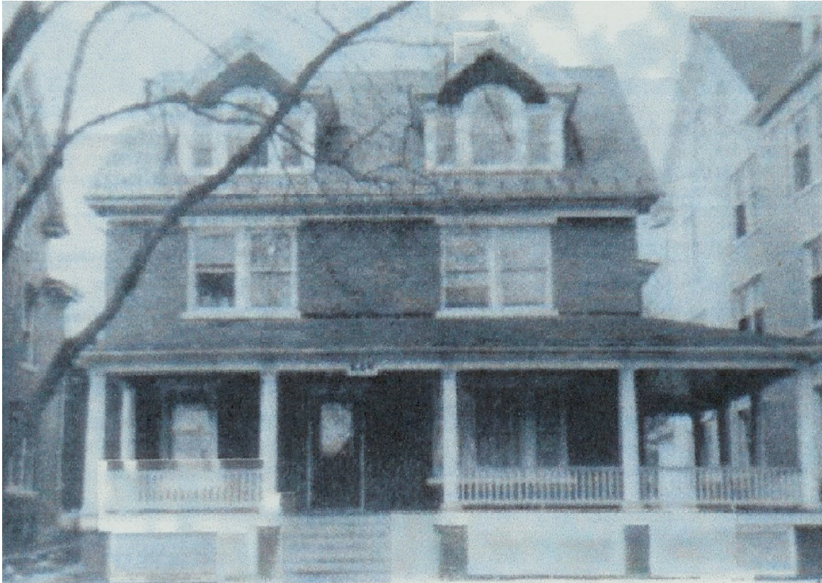
The Kappa Kastle – 523 W. College Avenue - 1952