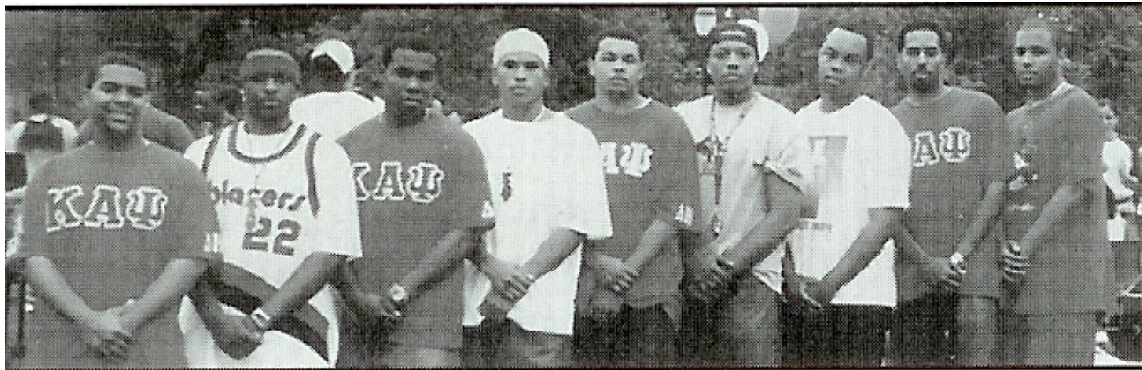
Delta Eta Members Take A Break During Campus Barbecue

The Delta Eta Chapter has been active with its Guide Right program, academic and cultural awareness efforts, social activities, and alumni relations since the beginning of the academic year; Chapter members hosted a forum on September 11 to discuss the effects of terrorist attacks.