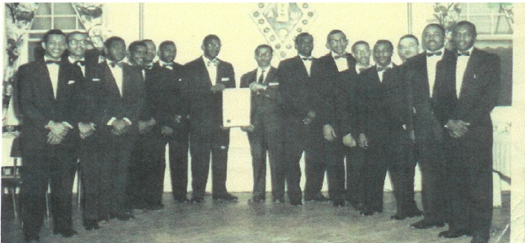
Charter Members of Dover Alumni – 1956