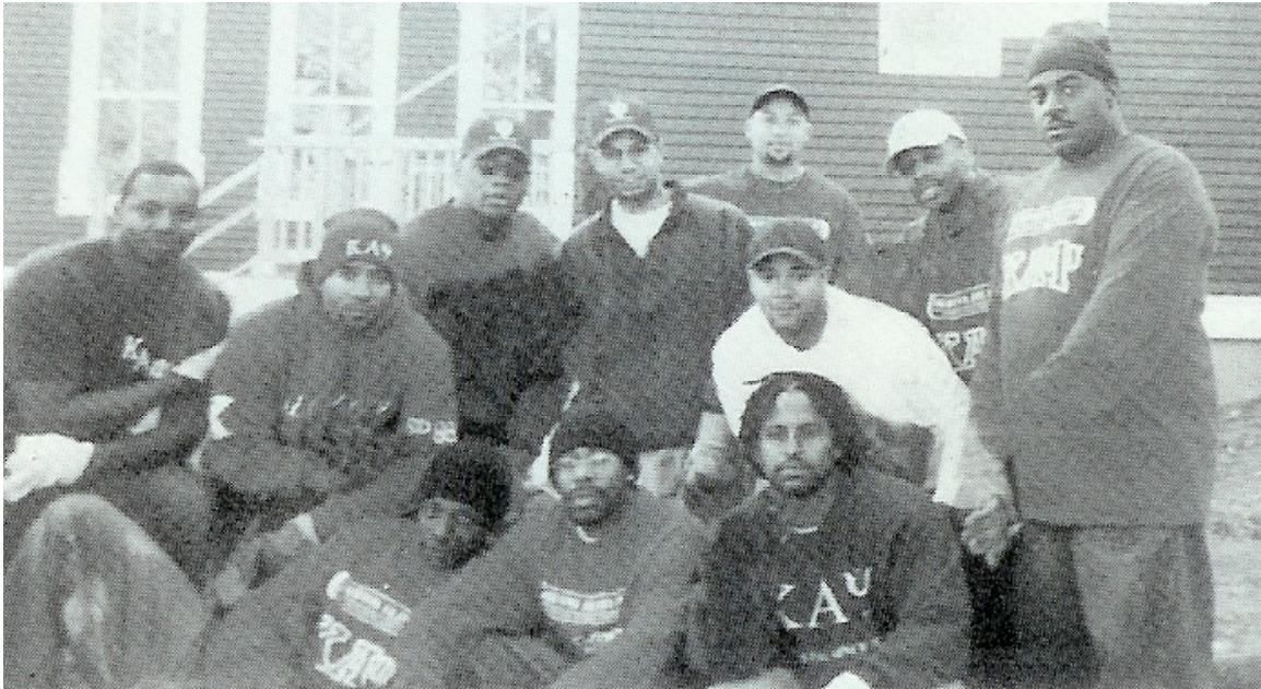
Boston Alumni Members Help With Community Cleanup Project – 2001

Boston Alumni Chapter completed its fall community service project October 26. Members participated in the City Year Serv-a-Thon Day by cleaning up and helping with construction at Paige Academy in Roxbury. Chapter members were assisted by members of the Boston Alumnae Chapter of Sigma Gamma Rho Sorority