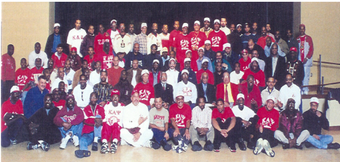
Delta Theta Chapter Celebrates It's 50 th Anniversary – October 16-18, 2002