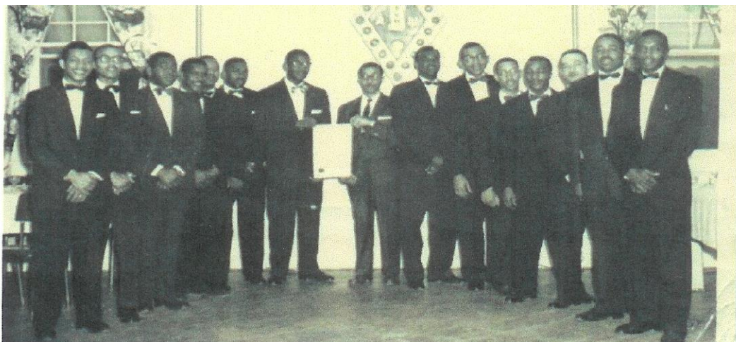
Charter Members of Dover Alumni – 1956