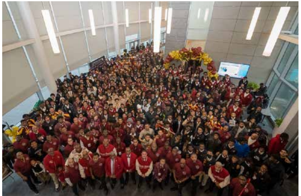
Bronx (NY) Alumni at the Kappa League Leadership Conference 2024