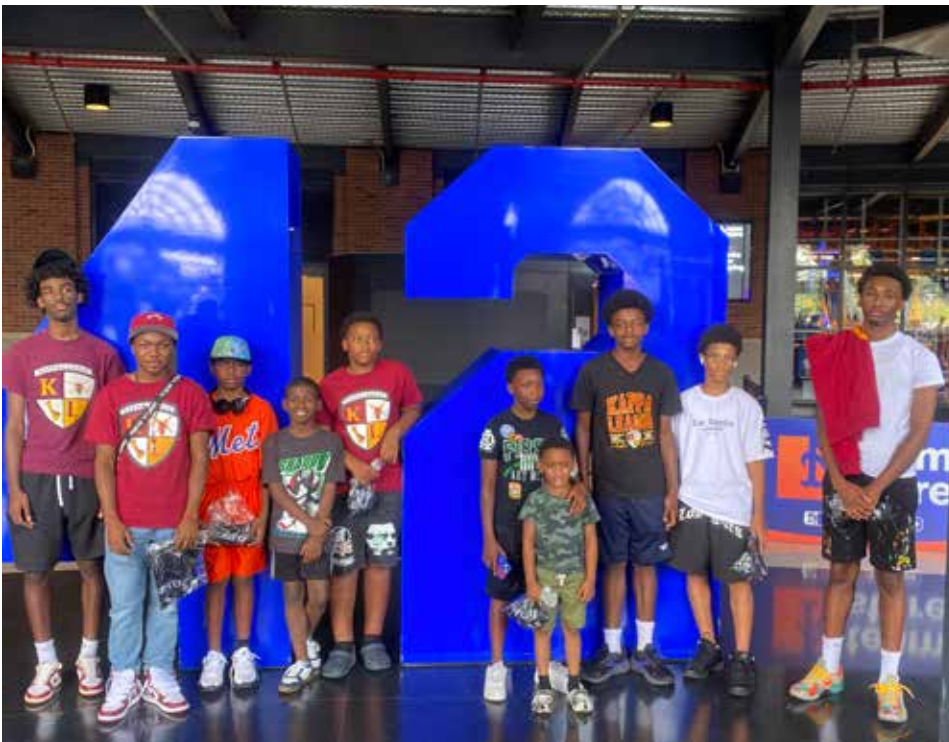
Clockwise: A great day for New York-area kappa Leaguers sponsored by Bronx (NY) and Brooklyn-Long island (NY) Alumni chapters.