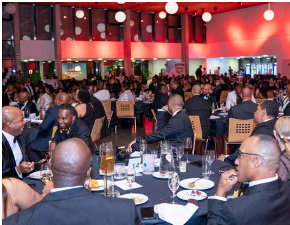
The Northeastern Province Polemarch Sanchious addressing the formal gala, which culminated the weekend's celebration of Germany Alumni Chapter's achievement.

contributions to service, but those who have helped us make an impact across Germany and the European continent for at least 60 years.