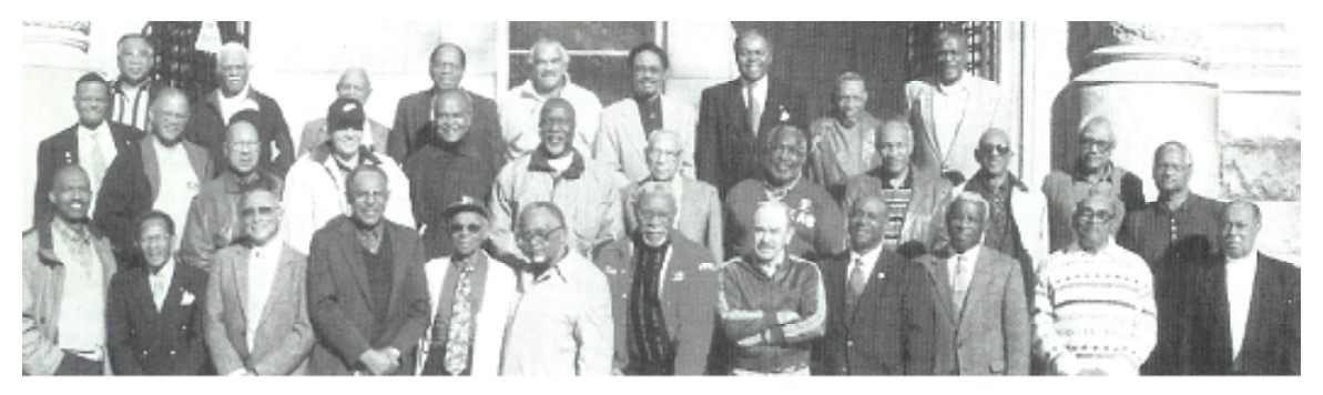
Philadelphia Senior Kappas after a recent health seminar - 1999